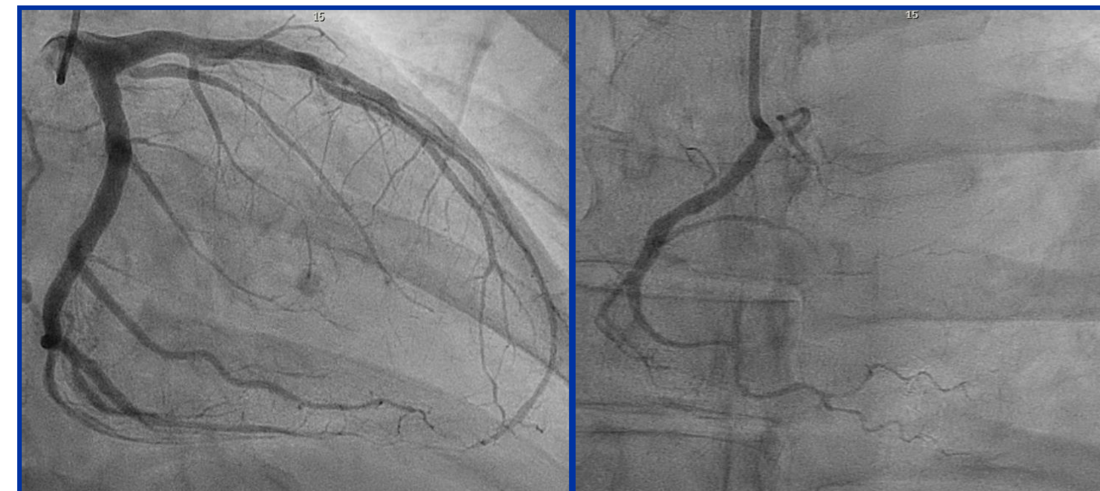
Fig. 2. Coronary Angiography. Catheterization demonstrated a left-dominant system with mild nonobstructive disease and no culprit lesion.