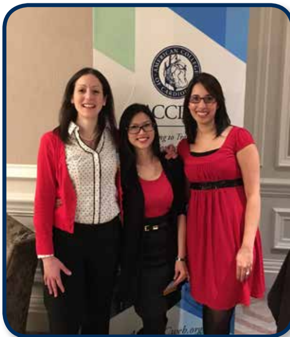
FIT attendees at the 2016 ACC Leadership Forum.

The Leadership Forum was a wonderful experience that gave me a better understanding of my role as a local leader in the College, improved my leadership skills, and helped me identify my individual goals as a member of the college. The forum also allowed me to build relationships with my peers that have carried forward even after the conclusion of the forum. Most importantly, the Leadership Forum has added to my armoire of skills and resources to more effectively contribute to the mission of the College.